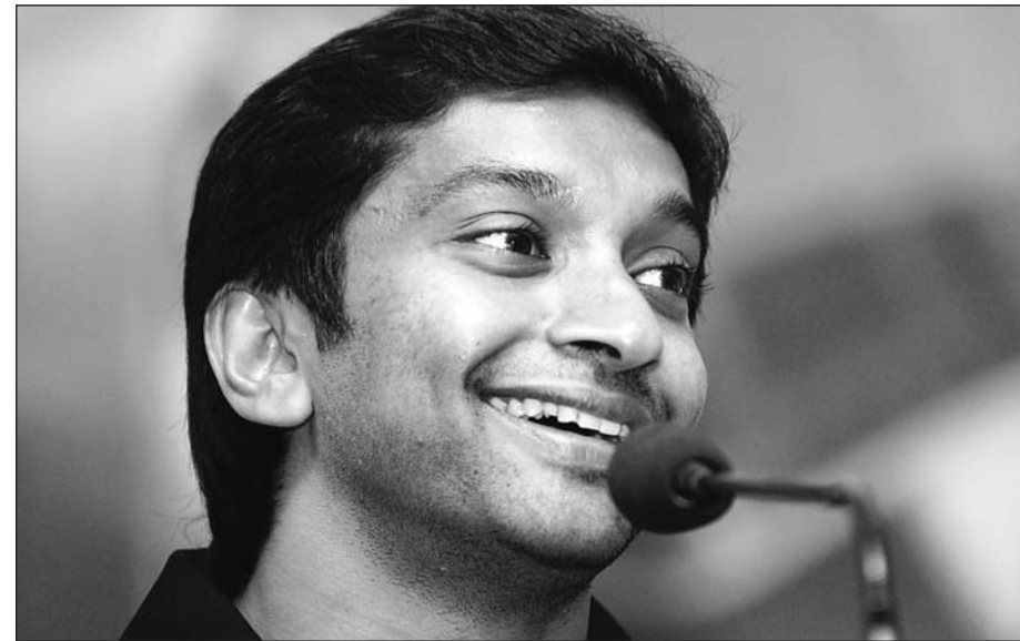
HAPPY MOMENT: Narain Karthikeyan says driving before the home crowd would be the most cherished moment of his career.

"I think, it will happen slowly. Hopefully, others will follow. After the first Malaysian Grand Prix, four corporates are supporting their F1 team," Karthikeyan said when asked if there will be a paradigm shift with regard to